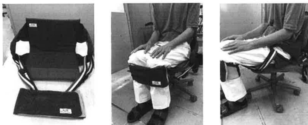
Figure 1 Transfer aid (LIFTY-PI:VO)

During the transfer procedure, the muscle activity of the care-giver in the standing motion was measured using a surface electromyogram (EMG) from the time at which the patient was in a seated position until the time at which the patient's buttocks departed from the surface. The point at which the patient's buttocks had lifted off the surface was confirmed using a pressure measuring device (GATE CODER, Anima, Japan). Muscle activity was measured using a wireless EMG (Vital Recorder 2; Kissei Comtec, Nagano, Japan). The target muscles were biceps brachii, erector spinae, rectus femoris, and triceps surae muscles on the right side. The landmarks of the electrodes were based on the work of Shimono 5 . After adequate skin preparation, surface electrodes (Blue Sensor N-00S, Medicotest A/S, Denmark) were applied parallel to the